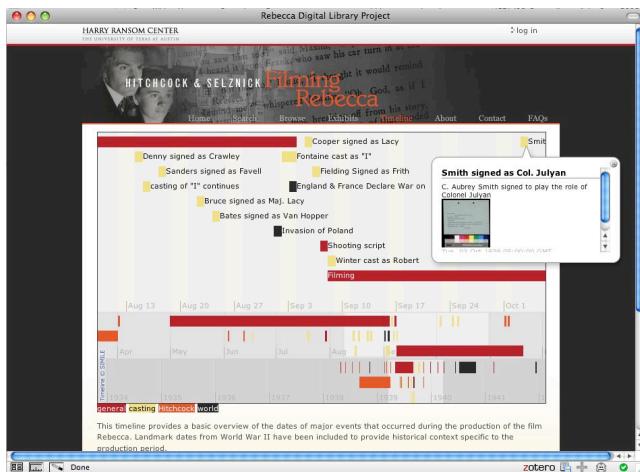
Figure 2. SIMILE-based timeline from 2008 course

While the example above is admittedly simple and anecdotal, it is important to recognize that as information systems increasingly become Web-based, the developers of these systems are increasingly more likely to resemble the students in the digital library course example than expert programmers with computer science degrees. The growing quantity of information resources becoming available in digital form naturally leads to a corresponding interest in creating focused collections of these information resources in a broadening range of disciplines and domains. The growth of digital libraries and digital media collections is one example of this, as are the efforts by publishers to provide increasingly feature-rich systems around their content. While, for instance, the New England Journal of Medicine might have the resources to hire computer science graduates to develop useful new features for their medical resource-based information seeking system [3], there will be many other situations (in archives, museums, and libraries, for example) where the people responsible for creating new information seeking systems do not have particularly strong programming backgrounds and are, in some cases, hired more for their domain expertise. Building blocks could help these developers better contribute to the creation of useful systems in new domains.